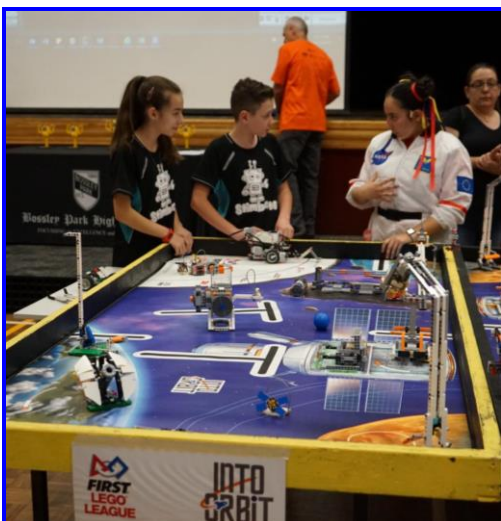
Some friendly advice from an official!