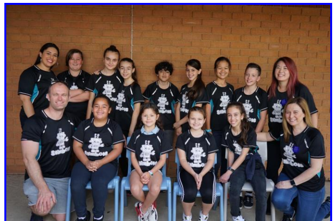
Our Senior STIMBOTS