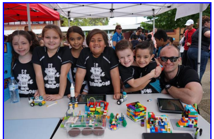
Our Junior STIMBOTS