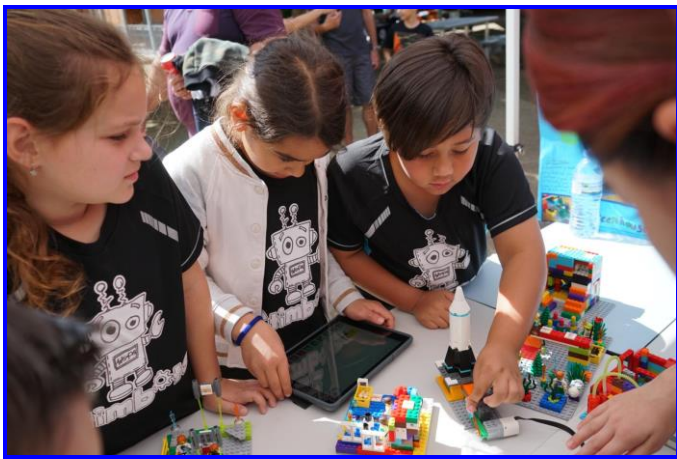
Practice time for our Junior Team!