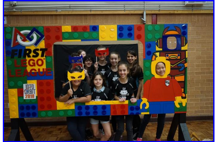
In disguise inside a Lego block!