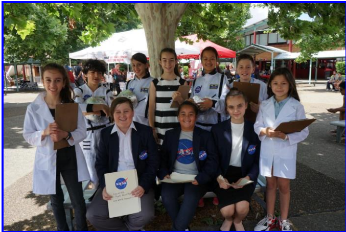
Presentation time for our Senior Team!